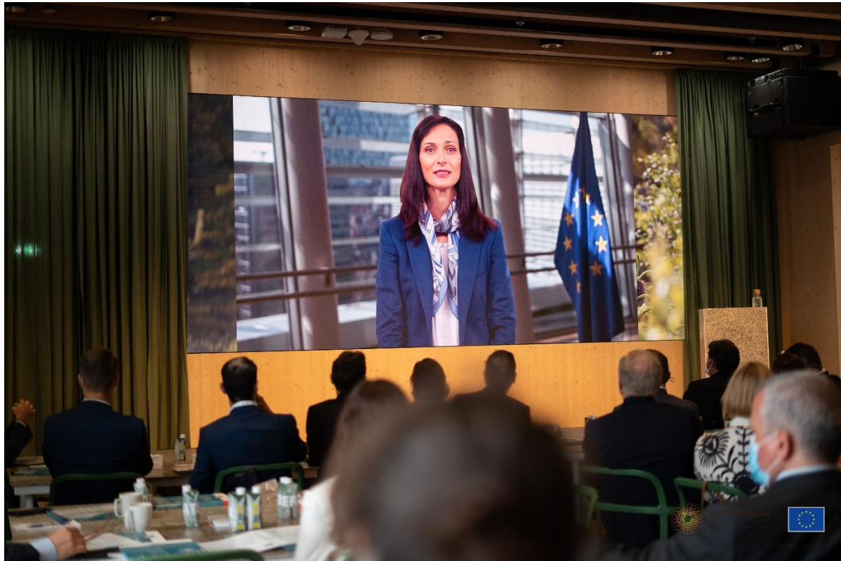
HE the EU Commissioner for Innovation, Research, Culture, Education and Youth, Mariya Gabriel addressing the event.